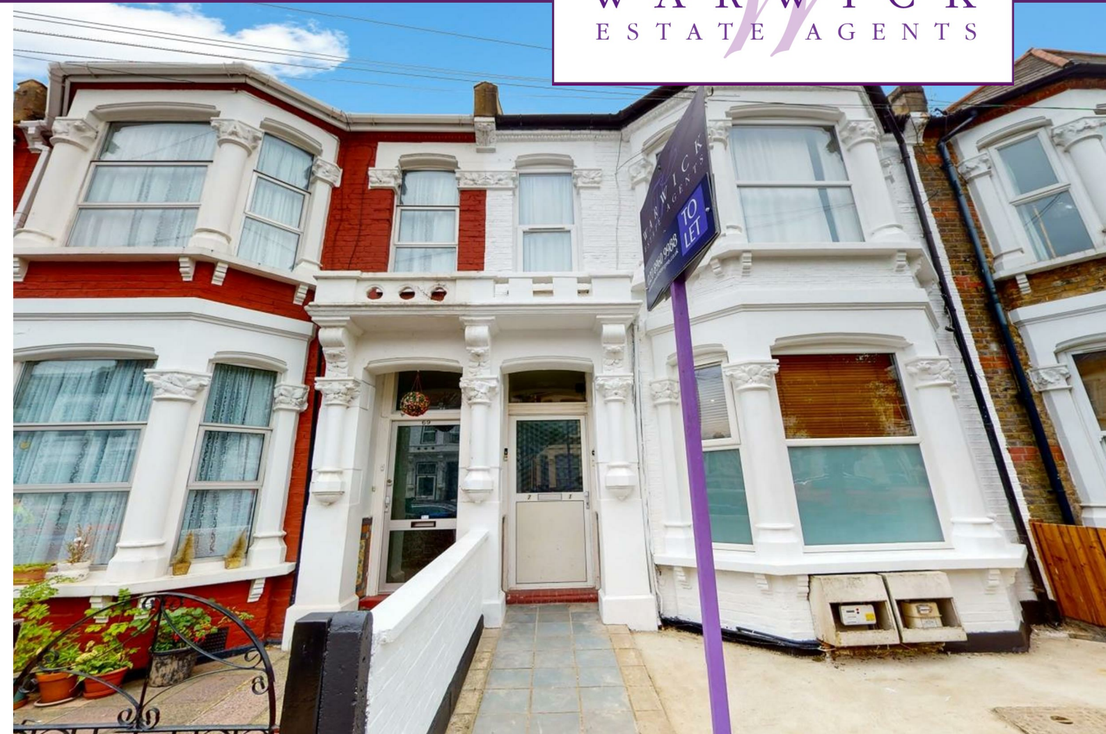
Burrows Road, Kensal Rise, NW10 5SJ